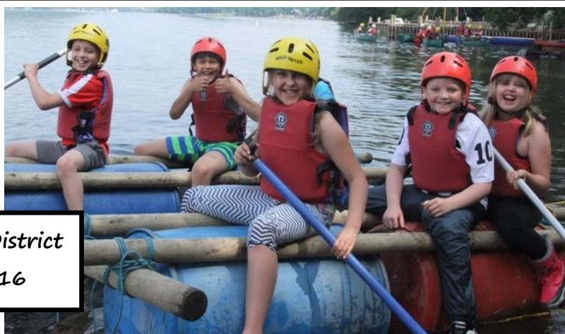
Lake District 2016

Our Father Day lunch is next Friday If you have booked, please arrive at school around 11.50-12.00am