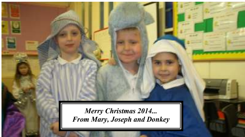
Merry Christmas 2014... From Mary, Joseph and Donkey

I wish you all a peaceful and happy Christmas.