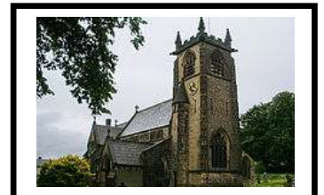
Christmas at St Thomas's

Christingle Service This Sunday 4.00pm Carol Service Christmas Eve 6.30pm Midnight Communion Christmas Eve 11.30pm Holy Communion Christmas Day, 10.30am