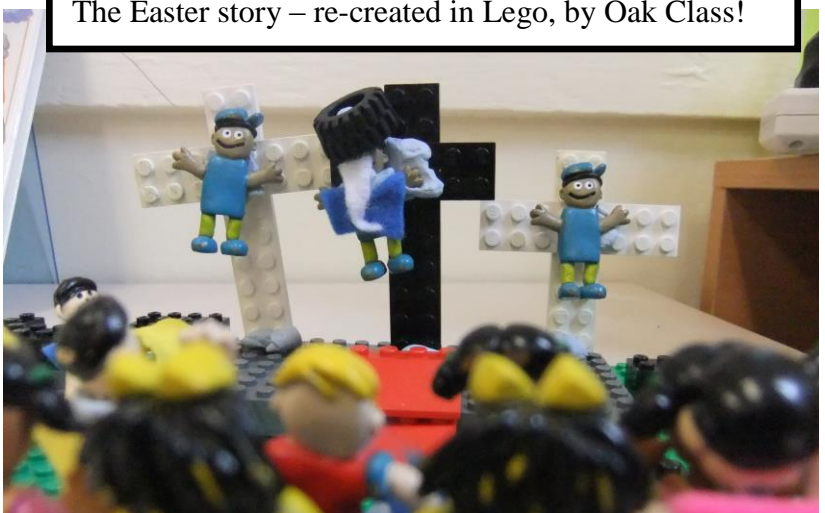
The Easter story - re-created in Lego, by Oak Class!

£98 was raised by you and the children for Sports Relief - a very worthy cause, well done!