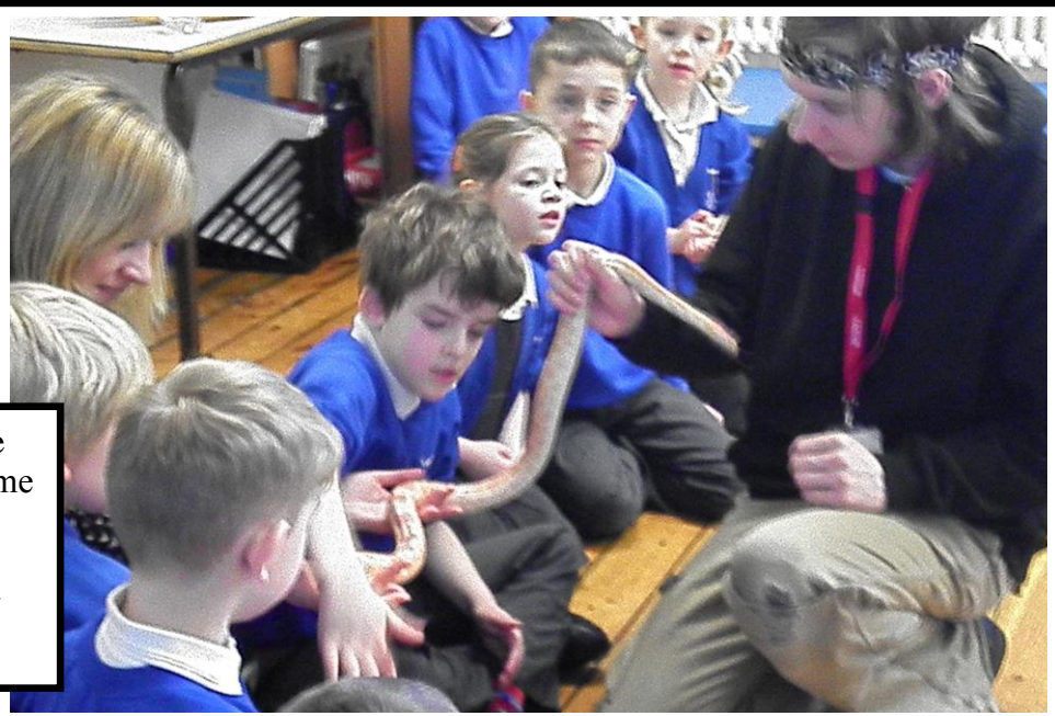
This week, we held a Science Day. 'Zoolab' visited and some very brave children got to handle rats, cockroaches, tarantulas and a very friendly Corn Snake called Solar