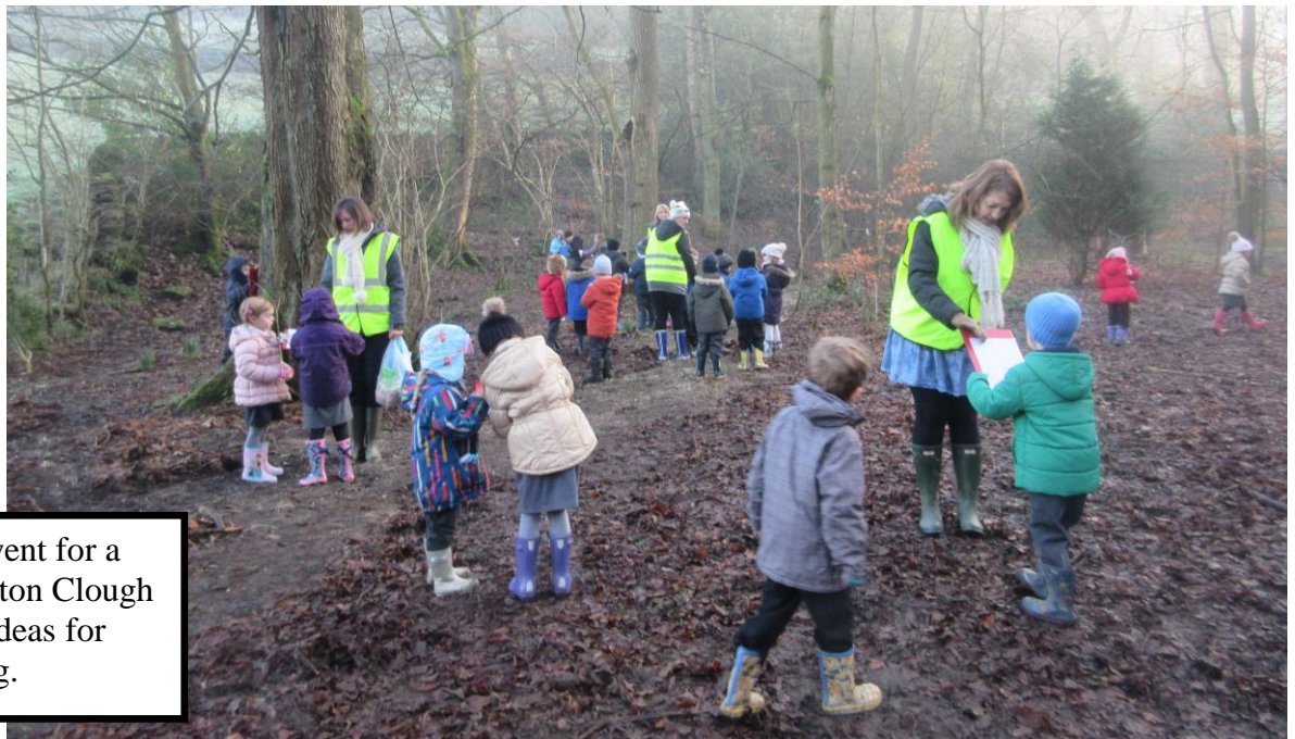
Blossom Class went for a walk through Sutton Clough last week to get ideas for their story writing.