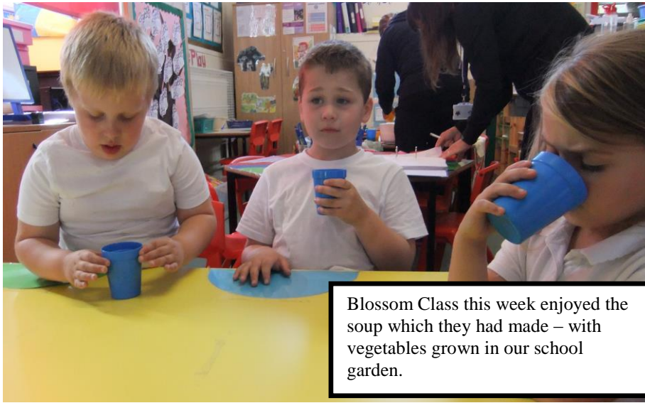
Blossom Class this week enjoyed the soup which they had made – with vegetables grown in our school garden.